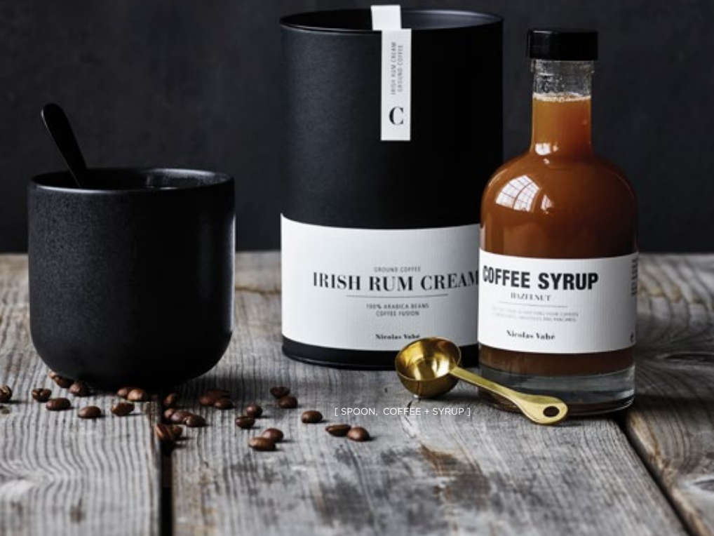
[ SPOON, COFFEE + SYRUP ]