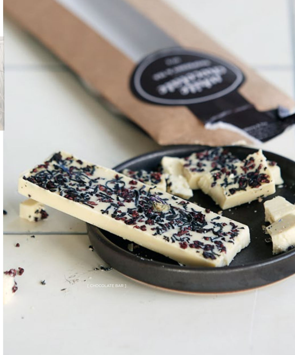
[ CHOCOLATE BAR ]

Wonderful, Beautiful White Chocolate with Raspberries and Tea. 50g.