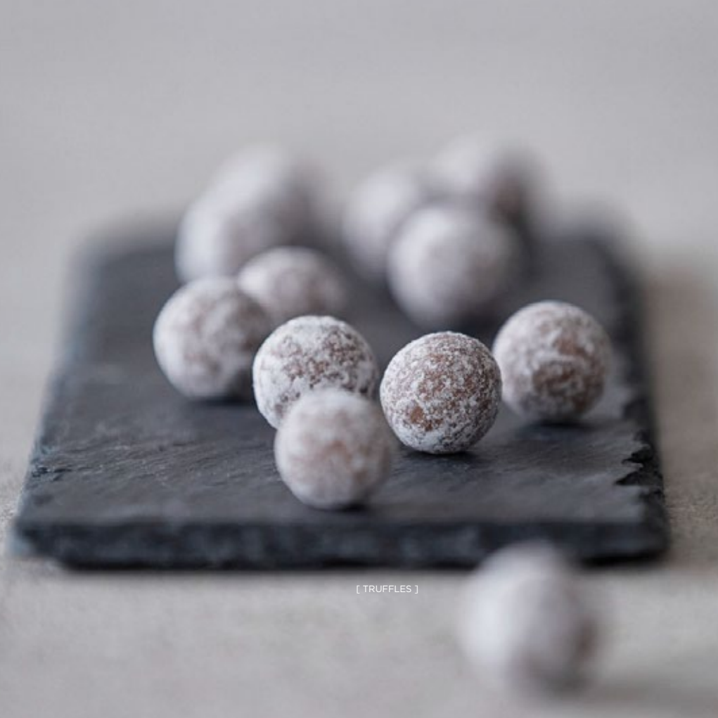
[ TRUFFLES ]