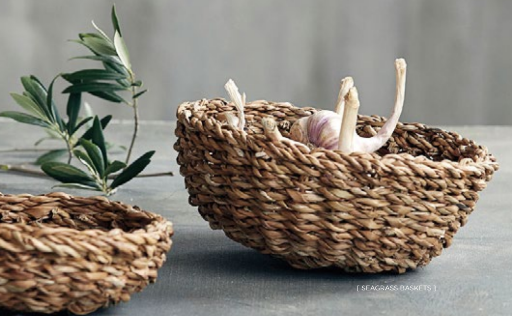
[ SEAGRASS BASKETS ]

Introducing our exclusive Gourmet Chef at home