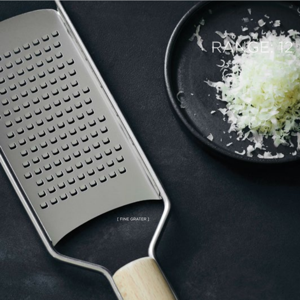
[ FINE GRATER ]