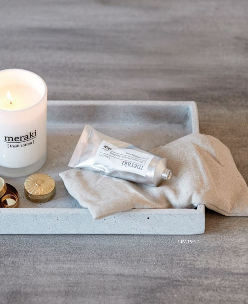
[ SPA TRAY ]