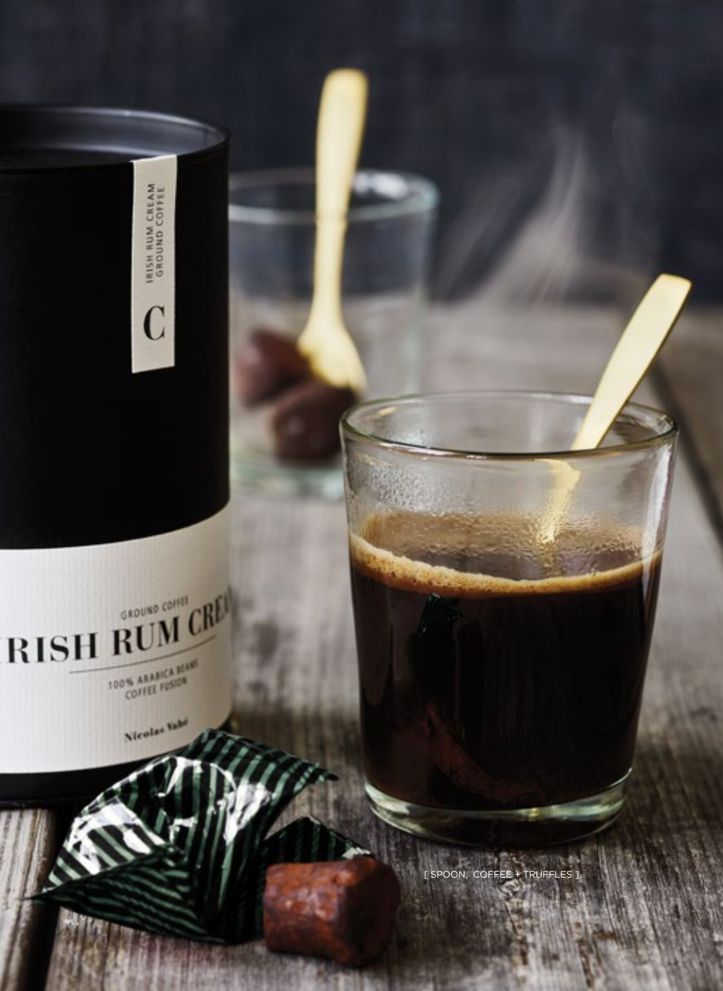
[ SPOON, COFFEE + TRUFFLES ]