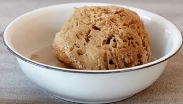
[ NATURAL SPONGE + SPA BASIN ]

Introducing our exclusive perfect Spa experience at home